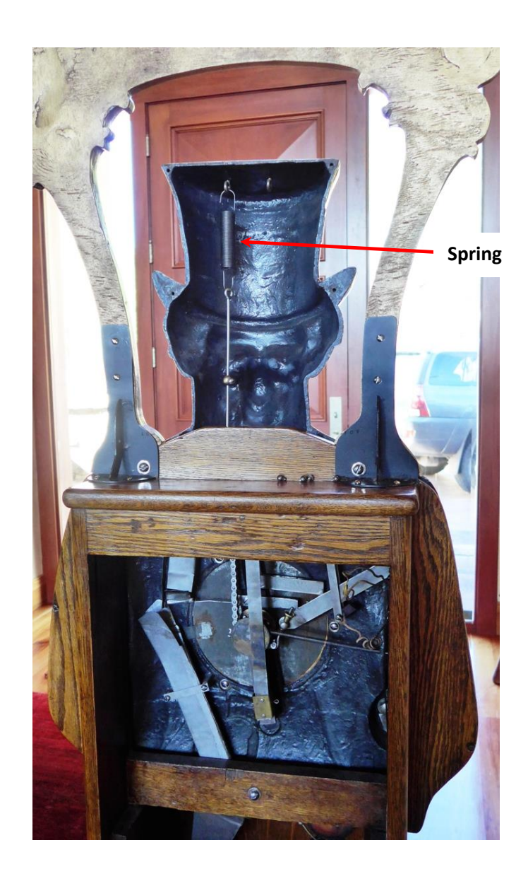
Fig. 15: The interesting mechanism cleverly implements the counter-force for the hand squeeze with a surprisingly small spring indicated by the red arrow. The spring is connected via a vertical rod to a chain wrapped around a sprocket on a shaft that rotates the front dial pointer. To the right of the mechanism you can see the coiled wire connected to a contact that is made when the wheel turns to the 300 mark – which causes the bell to ring from the power of a 1 ½ volt dry cell.

The cast feet have a hole in their tips so that the machine can be anchored to the floor, probably due to the topheaviness with metal castings on top and wood base – and anticipating users being aggressive with the hand shake to get to 300 and the bell ring!