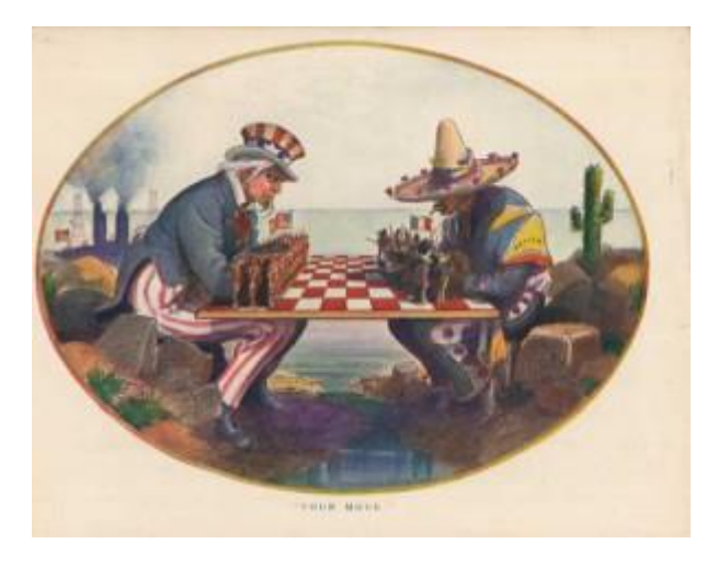
Fig. 2: 1890 cartoon showing Uncle Sam and Mexico playing chess with soldiers.