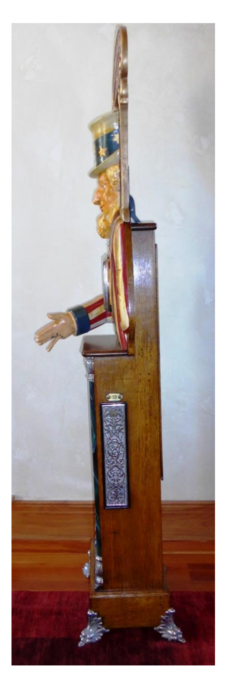
Fig. 14: Side view shows the fancy cast cash box cover.

The cast feet have a hole in their tips so that the machine can be anchored to the floor, probably due to the topheaviness with metal castings on top and wood base – and anticipating users being aggressive with the hand shake to get to 300 and the bell ring!