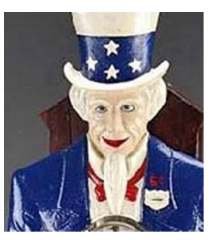
Fig. 22: Left 2 images are from Polaroids of a model actually shot in preparation for the Myths series of prints. Right is a close-up of the Uncle Sam arcade machine from Fig. 21. The Polaroids are from the Andy Warhol Foundation for the Visual Arts originating from the estate of Andy Warhol and sold by Christie's at auction.

"January 13, 1981 - I looked for ideas on the New Myths series. Also looked for Mother Goose pictures. But I think the best thing we decided to do is have people come and dress up in the costumes and we'll take the pictures ourselves, because that way there's no copyright to worry about."