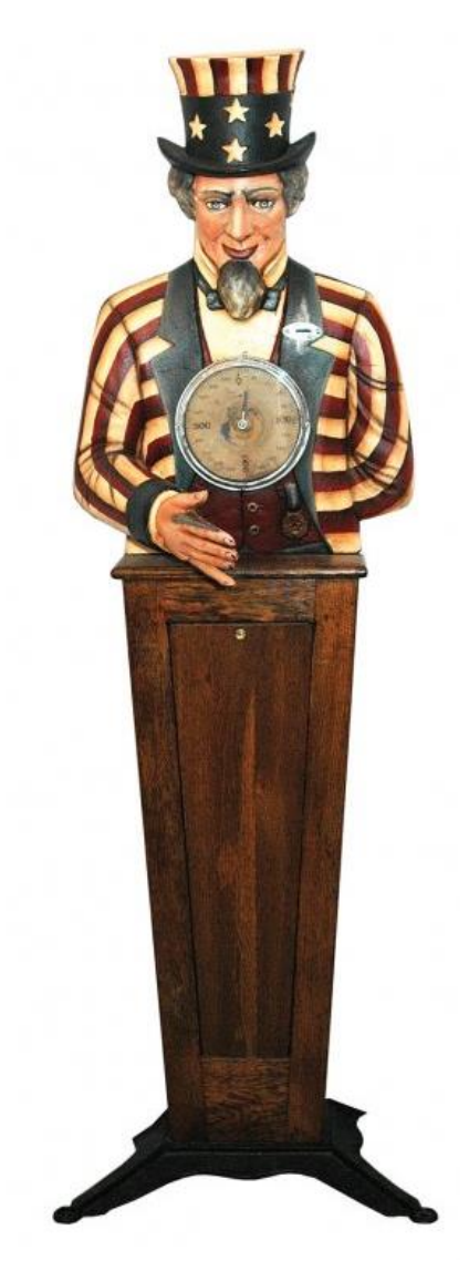
Fig. 11: Howard Uncle Sam at auction in 2006. "66 inches tall, scale and face are all original, some minor paint restoration on upper torso"

The earliest version of an Uncle Sam grip machine was created by the Howard Company in 1904.