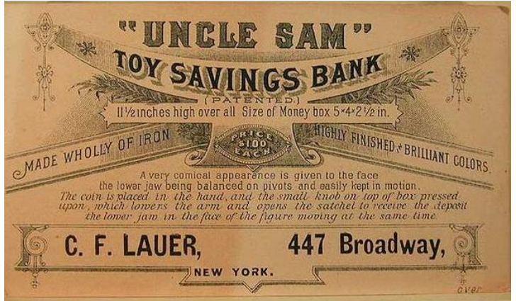
Fig. 9: An example of a Shepard card for the Uncle Sam Bank.

It is a generally accepted fact that Shepard originated the full-color "trading card" method of advertising mechanical banks. These cards are about 2-1/2" X 5-1/2" in size and were printed on thick paper stock. They were used by Shepard bank dealers to promote the sale of the banks to their customers. Each card shows the retail price at $1.00 each for a bank. Introductory dealer cards also listed the wholesale bank price, which was $8.50 per dozen. This translates to about 70¢ each, for a 30% wholesale discount. These cards are highly collectible and expensive today.