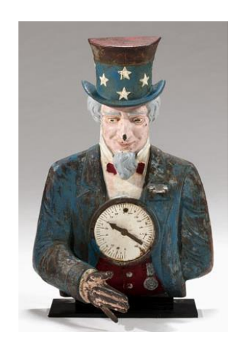
Fig. 20: This Uncle Sam is a strength tester and appears to be old but of unknown manufacture. It sold at an auction in April, 2006 with the following description:

"A painted cast iron Shake Hands with Uncle Sam Strength Tester, American, early 20th century. The coin operated arcade machine with dial painted red, white and blue, mounted on an iron stand.