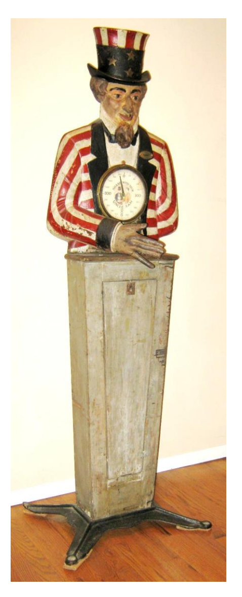
Fig. 12: Howard "The Hand Shake" Uncle Sam in original condition

Howard had plenty of Uncle Sam images to choose from in creating its machine. Since there is a stand present instead of a lower torso, a red and white striped jacket with blue lapels were used instead of an all blue jacket — undoubtedly to capture the red, white and blue concept of the full image as shown in the cartoons. The Howard figure shows a more youthful Uncle Sam (darker instead of white hair) and what its flyer called: "a jovial smile on his face" rather than the stern face that would later become the standard after 1916.