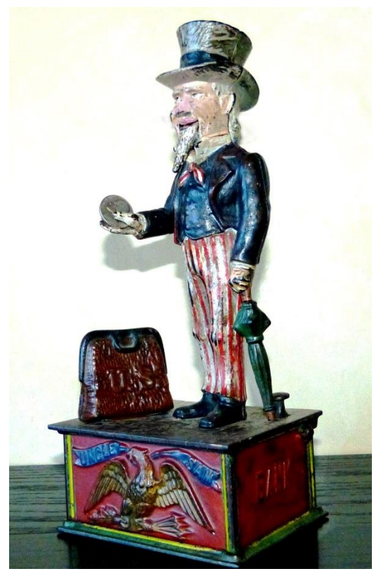
Fig. 8: Original Uncle Sam Bank, with original paint. 11 1/2" tall. Rick Crandall collection.

"A comical appearance is given to the face, the lower jaw being balanced on pivots and easily kept in motion. The coin is placed in the hand, and the small knob on top of box pressed upon, which lowers the arm and opens the satchel to receive the deposit, the lower jaw in the face moving at the same time."