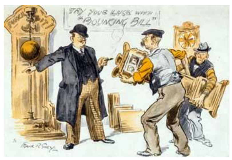
Fig. 10: Proprietor (arranging an amusement arcade): 'Ere, shove that machine that's always going wrong next to the punch ball, so that if a bloke loses a penny likely as not he'll vent 'is hexasperation in a penn'orth of punch ball.

Athletic test machines were really the first arcade games, but even before that, the first coin-op amusement machines were "exhibition machines." Examples are Henry Davidson's Chimney Sweep of 1871 or William T. Smith's The Locomotive of 1885 (one the first U.S.-made coin-op amusement machine). In the 1880s, various strength testers etc. began to appear in bars and taverns. Actually, they had been there before but in 1885 Robert W. Page of London, England had a coin-op "Hand Shake" machine in the market with a U.S. patent issuance (#373,942) in late 1887. Lifting machines involved pulling on handles; grip testers involved squeezing handles.