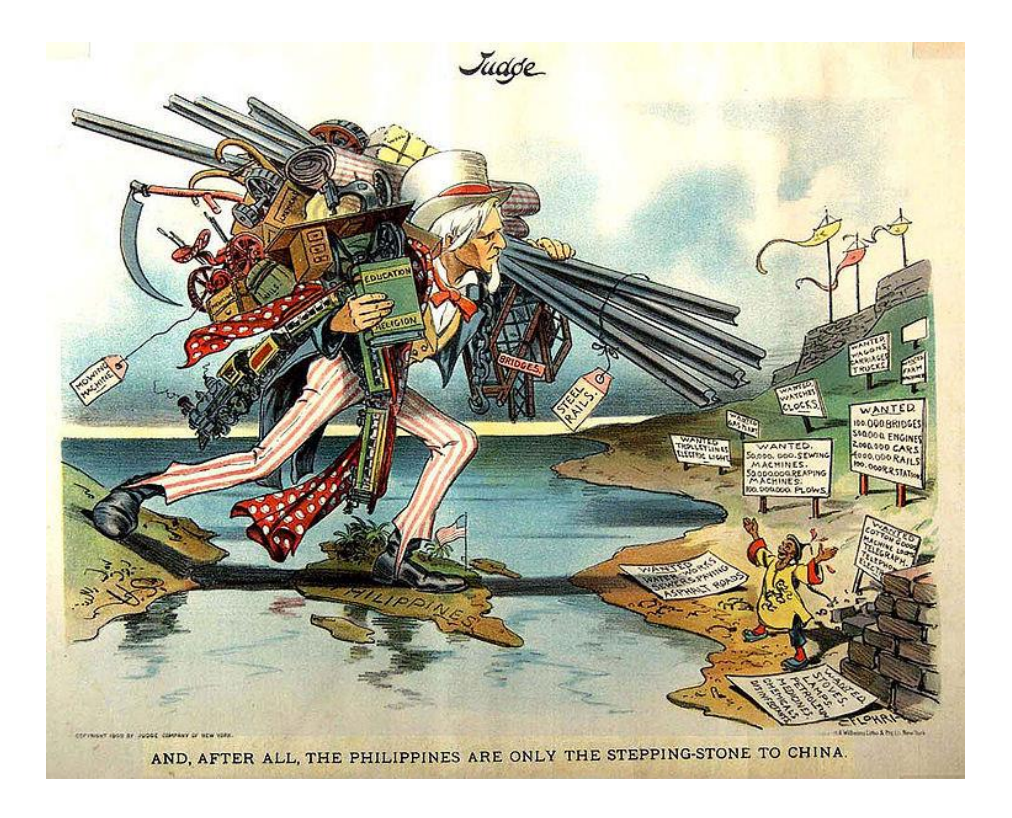
Fig. 4: 1902 from a Judge Magazine editorial cartoon after US conquest of the Philippines. Uncle Sam stepping across the ocean into the Philippines loaded with symbols of modern civilization.