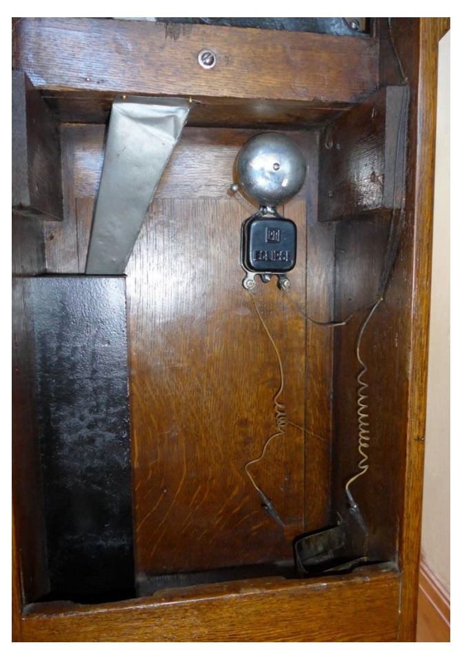
Fig. 16: Above: lower rear of Sam. On left is the coin chute entering the top of the cash box enclosure. The bell is powered by a 1 ½ volt dry cell battery (on order at the time of this writing). It rings when the hand squeeze is strong enough to register 300 on the front dial.

Right: the cash box fits in the cast enclosure accessed from the side exterior of the machine which is different than many slot machines. Usually the rear door needs to be unlocked to access the cash box, but with the Uncle Sam fastened to the floor through its feet – that would