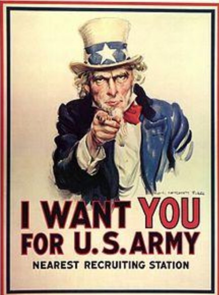
Fig. 7: The poster image of Uncle Sam was shown publicly for the first time in a picture by Flagg on the cover of the magazine Leslie's Weekly , on July 6, 1916 and again on the cover of the Feb 15, 1917 issue shown above left. More than four million copies of this image were printed between 1917 and 1918. Flagg used his own face for Uncle Sam, and Army veteran Walter Botts provided the pose.